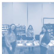
2018 Faith in Action Grant Winners The St. Teresa of Avila Catholic Parish was awarded a grant from the Archdiocese of St. Louis for its Women's group. The grant will be used to support the group's activities and to provide support for the group's members.