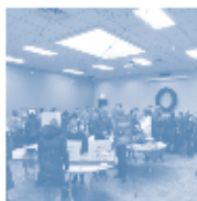
Virtual Ministry E-Kit The St. Teresa of Avila Catholic Parish was awarded a grant from the Archdiocese of St. Louis for its Virtual Ministry E-Kit. The grant will be used to support the group's activities and to provide support for the group's members.