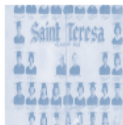
125 Years of History The St. Teresa of Avila Catholic Parish is celebrating 125 years of history. The parish was founded in 1893 and has since grown into a vibrant community of faith.