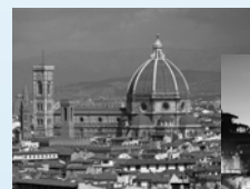
Florence, Rome and Assisi