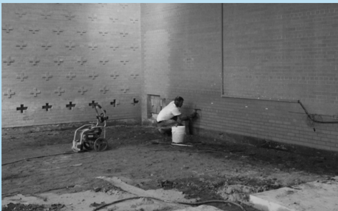
Creating space for our legacy stained glass windows; restoring the raised brick crosses that were broken by the cement risers, etc.