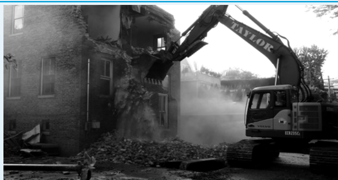
On Tuesday morning, September 2, 2014, demolition began in earnest on Avila Place.