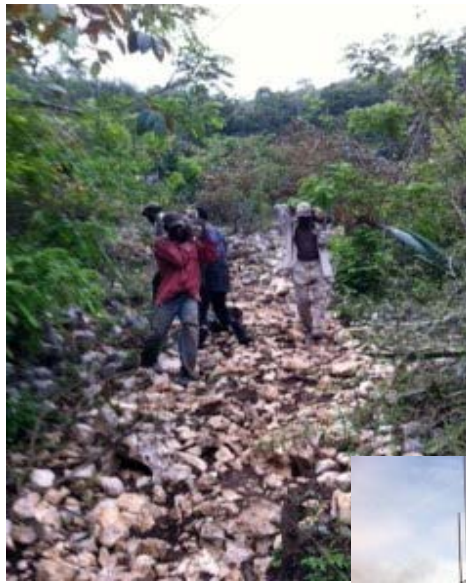
Spring 2012 Left: Villagers carry stones for the worksite.