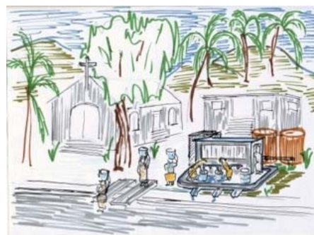
Artist sketch of the proposed well.