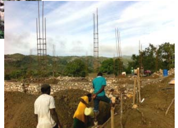
Below: St. Rose of Lima foundation and structure.

Sixteen St. Teresa of Avila parishioners met in April 2012 to discuss the parish's involvement in the future of its involvement in helping the poor of Haiti. Building on the current interest in Haiti and St. Teresa's work there, it is hoped that a forum could be held in which Haiti, its culture and the work of the Church among the Haitian poor would be highlighted.