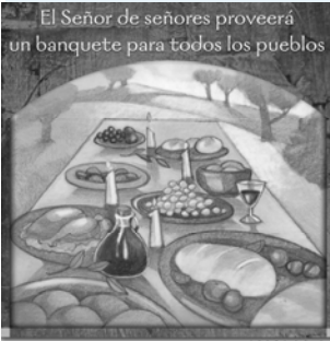
El Señor de señores proveerá un banquete para todos los pueblos

¡Qué maravillosas imágenes tenemos hoy del Reino de Dios! Isaías nos habla de un gran banquete –un banquete celestial– una fiesta con abundancia de platillos succulentos y vinos exquisitos. Es una celebración del mismo Señor, explica Isaías, cuando Dios unirá a todas las naciones, secará toda lágrima, y destruirá la muerte para siempre. Entonces, también, la tierra entera se regocijará en el Señor y se deleitará en la gracia salvadora de Dios.